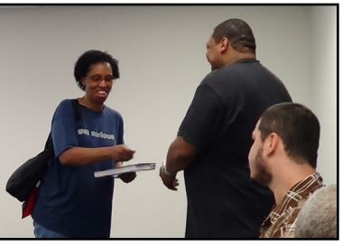
Busy, Busy, Busy is all I can say for the HOPE Troupe. Many changes have taken place, but one thing will always remain the same and that is the message they try to convey to the public about the stigma's associate with mental illness. Be sure to catch a performance in your area.